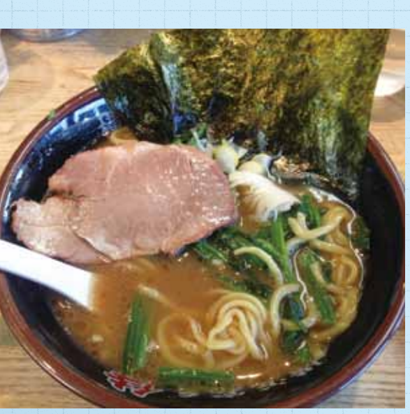
Ramen at Samurai.

2,000 for males and 1,800 for females. More than half calories that we take in a day! The student interviewed above said he seems to be getting fat day by day because of ramen.