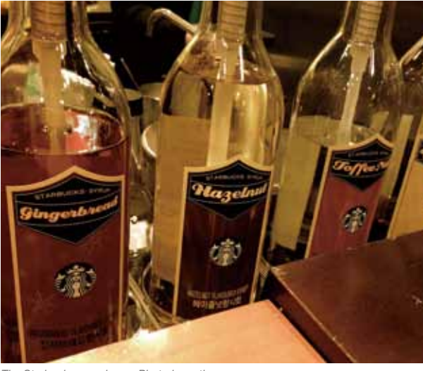
The Starbucks experience.

When the CEO of Starbucks, Howard Schultz, travelled to Italy, he realized that cafés were not only places where people just drop by to get their morning dose of caffeine, but a place where people held business meetings and talked to each other -- a sort of mechanism that held the Italian society together. Inspired by this view, Schultz persuaded the leaders of the company to transform Starbucks into such a place where friends can meet up and stay. Here, he added luxurious sofas, dimmer lighting, and jazzy music to the background. The café became somewhere people can get a premium traditional cup of espresso drink and relax.