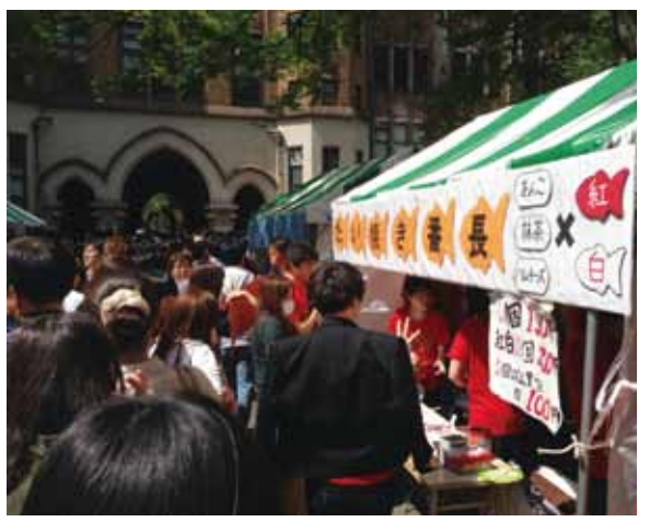
May Festival at the Hongo campus. Photo by author

In setting up food booths in the school festivals, preparation beforehand is necessary. It's better for you to start thinking now of what kind of food to sell. It is fun, too, to come up with many ideas and to simulate them in your own mind! So let's try it!