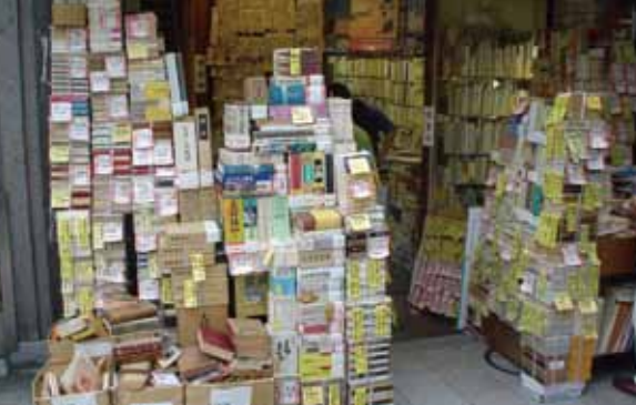
Jimbocho, Tokyo.

In Jimbocho, I could not help at ponder what has maintained Japan's prevalent second-hand book and publishing industry in today's digital information age. A substantial amount of readership should be indispensible. The 180 bookstores in Jimbocho is a cultural phenomenon, but they are also inevitably profiting businesses. Japanese people's ardour about reading has supported Jimbocho's continuous prosperity. When we are amazed by the unique cultural ambience of Jimbocho, we should also think about the national culture that is represented here. When materialism is engulfing the world, whether we could keep being ourselves and enrich our spiritual pursuits is something we have to think about.