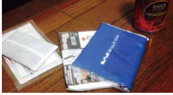
Winter survival techniques.

While kairo can warm up one's body from the outside, hot drinks helps people warm up from the inside. In Tokyo, there are many business men who spend every morning at a café, holding a cup of coffee in one hand and newspaper in other. For students, though, café is considered too expensive to go often, and many would prefer to either have it on the go, or bring it to their morning classes. Because of this, hot canned