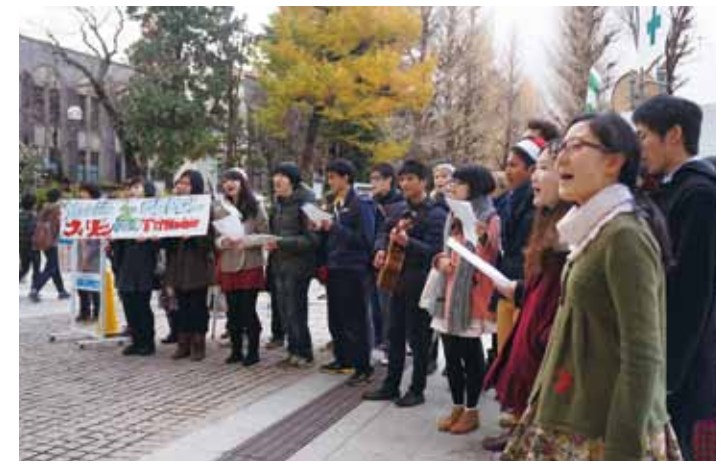
Christmas Caroling for the Philippines.

The event accomplished its primary goal, raising a total of ¥39050 for the Philippines. Apart from that however, it also provided an opportunity for Todai students to gather, momentarily free themselves from the stress of daily life, and work (or sing, in this case) together for a unified cause.