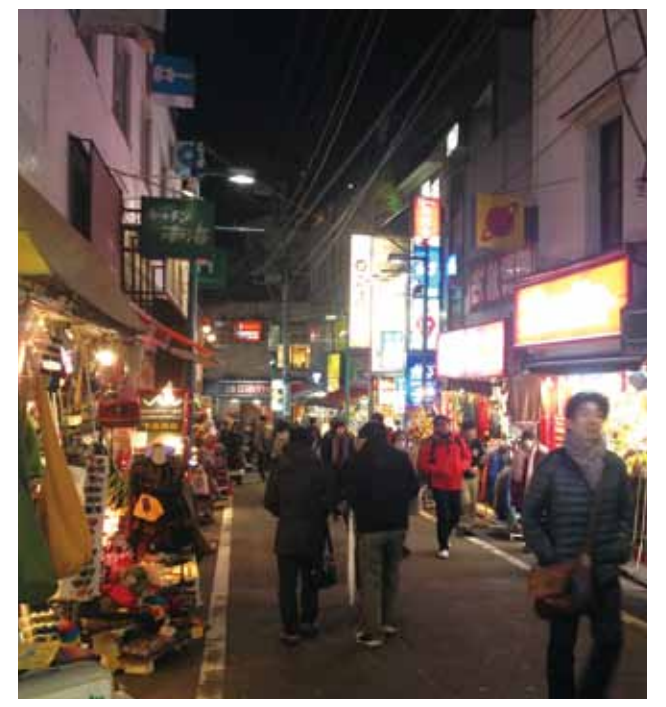
Shimokitazawa, South-exit shopping street.

Shimokitazawa is another popular spot with Todai students following Shibuya. You can easily walk along the railroad tracks to get there on foot from our campus. It is famous for the drama theaters and fashion. The atmosphere is very casual. There are not many tall buildings and looks less urban. Streets around Shimokitazawa are very complex. It is difficult to find where you want to go even if with a map. However, rambling around itself is very interesting there. You will discover interesting places tucked away in the corners of Shimokitazawa every time.