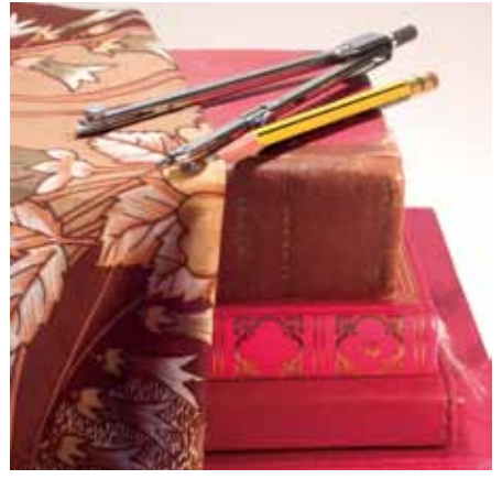
Titles and certificates don't tell the whole story. What drives you?

The ability to pursue opportunities is a skill that does not come naturally. However, what we can do is to at least try to avoid the path of least resistance, be a little reckless and attempt to make university life more difficult. With more thought put into it, one's time at the university is the best chance to prepare oneself for the next stage in life. Passing the screening and getting into a name university is not an end in itself, but simply a tool among others to move forward in probably the only examination that matters, life. Things end when life ends, and in a country known for having the longest life expectancy, this is just the start of one, hopefully crazy, examination.