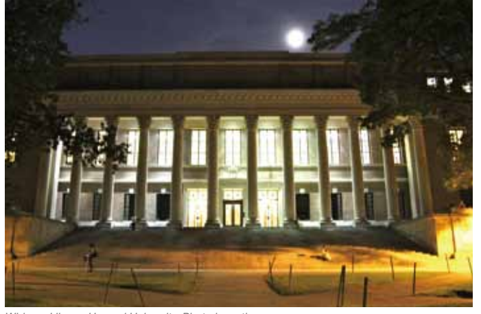
Widener Library, Harvard University.