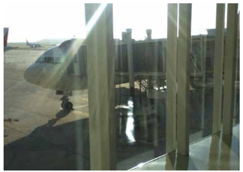
A few meters separating me and the aircraft that would take me to a brand new chapter in my life.

However, I soon realized that this would be the first time that I would leave my family for an extended period of time, and as I'm sure is the case for many students who go abroad to study for the first time, I felt nervous. I suddenly felt uncomfortable about going to Japan, a land that, to me, was as famous for its cultural beauty and high standard of Asian modernization as it was for its recent development of a rather bizarre culture. This, coupled with the worries about the radioactivity that were so hyped up in