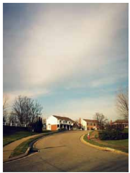
The road that takes us home-where we belong.

A simple question of "where are you from?" has one answer to some of us, but to others, the answer is a long winded explanation that has molded who we are today.