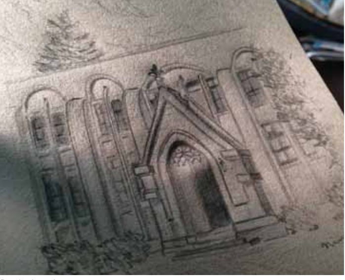
Drawing by author.