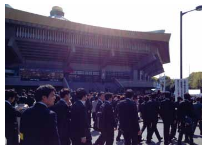
Outside the Budokan before the ceremony.

However, given the scale of the issues faced within the university such as budgetary constraints, as well as those from wider society, whether Tōdai will be able to successfully diversify itself remains to be seen.